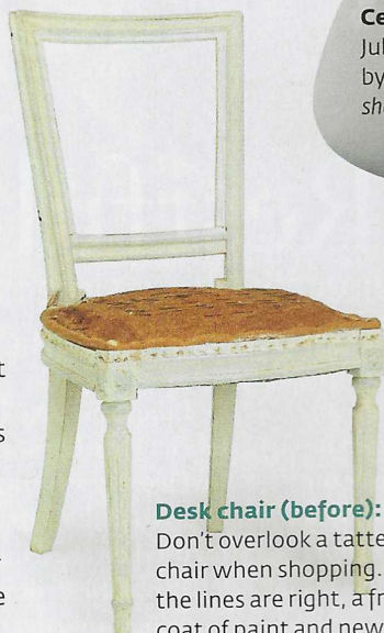
Desk chair (before): Don't overlook a tattered chair when shopping. If the lines are right, a fresh coat of paint and new upholstery are all it needs.

Splurge on a few yards of your favorite fabric, and then use it sparingly on several key items in your room. Heather's floral fabric made appearances on the canopy, pillows, and desk top. "I got away with using about 7 yards," she says. To avoid having to buy extra material to meld together two pieces for the canopy, she suggests taking a piece from one bolt and adding a 4-inch mitered band of linen around the edges. STYLE SECRET: "Canopies tend to sag over time, so if you want yours to be tight, make it a few inches smaller than the inside dimensions of the bed," Heather says. ➔