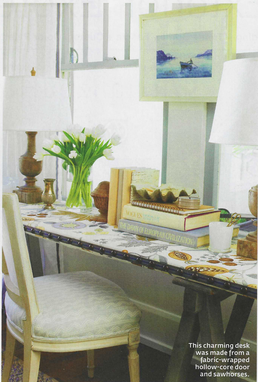
This charming desk was made from a fabric-wrapped hollow-core door and sawhorses.