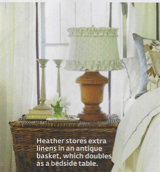
Heather stores extra linens in an antique basket, which doubles as a bedside table.

Toss in nontraditional finishing touches to upgrade your look. A vintage European basket makes a unique and functional bedside table. (Good-bye, clutter!) Heather upgraded an ordinary lampshade with the same fabric she used on her desk chair. She made a boudoir pillow out of a Hungarian grain sack and customized it with her monogram.