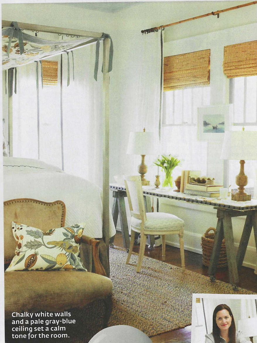
Chalky white walls and a pale gray-blue ceiling set a calm tone for the room.