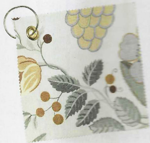
Inspiration fabric: Four Seasons/Winter (4006-01) by Victoria Hagan Home Collection; victoriahaganhome.com